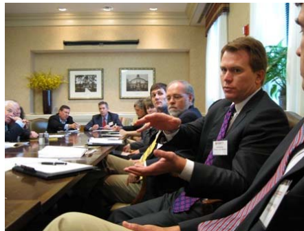
The Advisory Council met for the first time on Oct. 24 at the Florida State University Center Club.