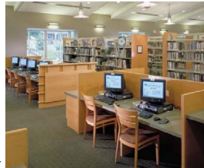
Libraries in Florida often provide a range of services to the public before and after a hurricane.

ners to better prepare for and respond to hurricanes.